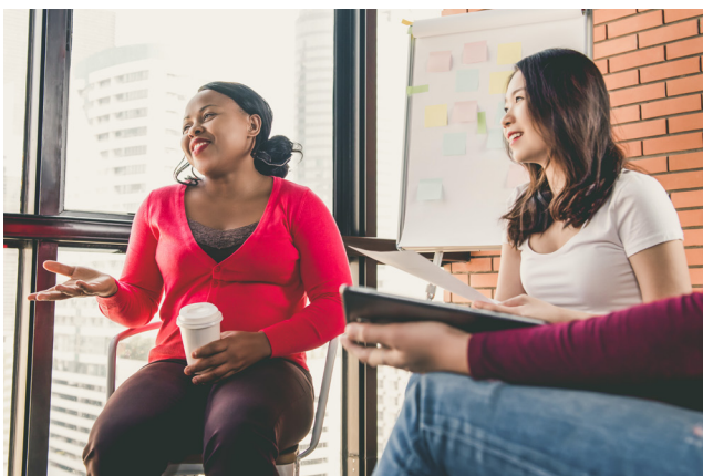
Figure 1: The Best Leaders Bring Out Two to Three Times the Talents in Others Compared to the Worst Leaders

This percentage is in sharp contrast to what people report when they think about their most admired leaders. The best leaders bring out anywhere from 40 percent of our talents (this bottom was the top of the range for the worst leaders!) to 110 percent.